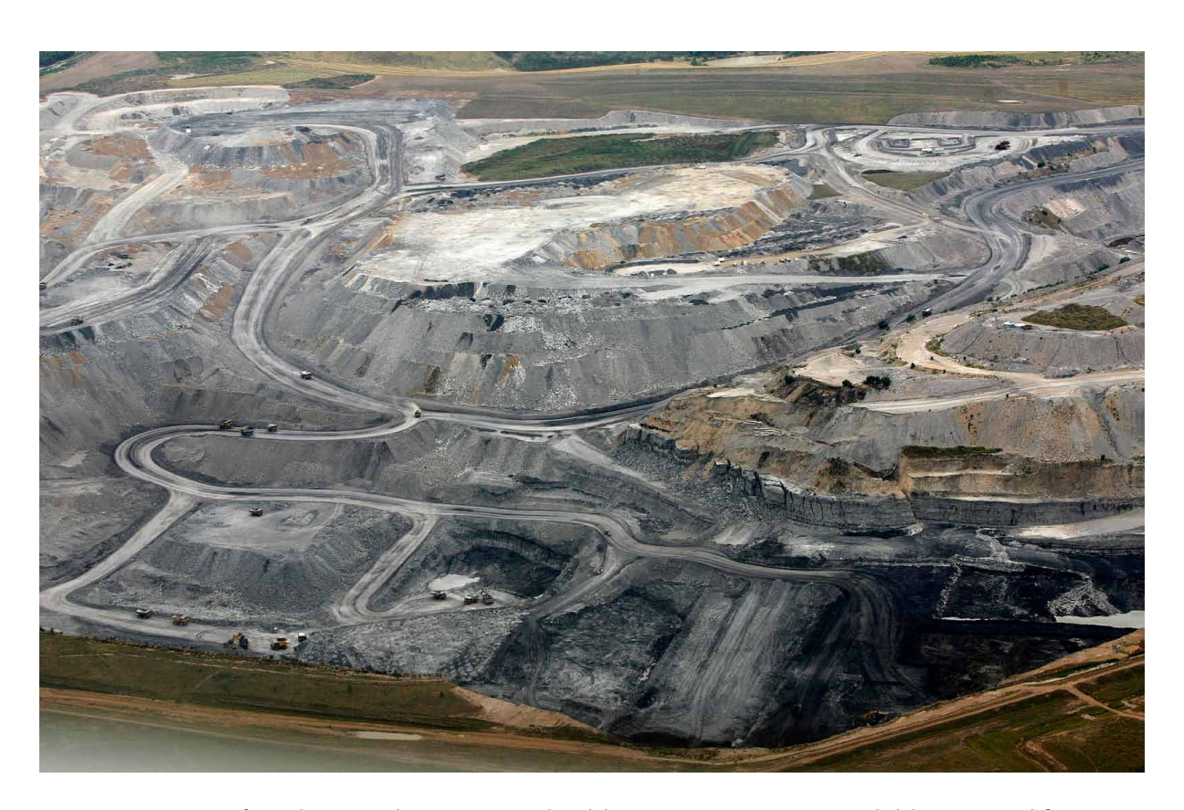
Economics can favour keeping coal mines operational until the money runs out – creating a rehabilitation cost risk for taxpayers when the company goes bankrupt

In February 2016 Goldman Sachs recognised that if a mine is running at a loss and expects to keep doing so, instead of ceasing operations, getting a start on rehabilitation and paying out workers' entitlements, there is a financial advantage to the company to keep operating the mine until the company's cash reserves run out.<sup>17</sup> Of course, while the mine is operational, there is always the hope that the mining cycle will rebound. That seems unlikely in the current circumstances as many analysts recognise coal is in structural decline.<sup>18</sup> If governments do not have sufficient financial assurance for the total rehabilitation costs, the site may never be rehabilitated or the taxpayer will foot the bill.<sup>19</sup> With respect to climate change coal-producing, loss-making mines keep coal markets oversupplied and prices low, encouraging more short-term coal use instead of cleaner alternatives.<sup>20</sup>