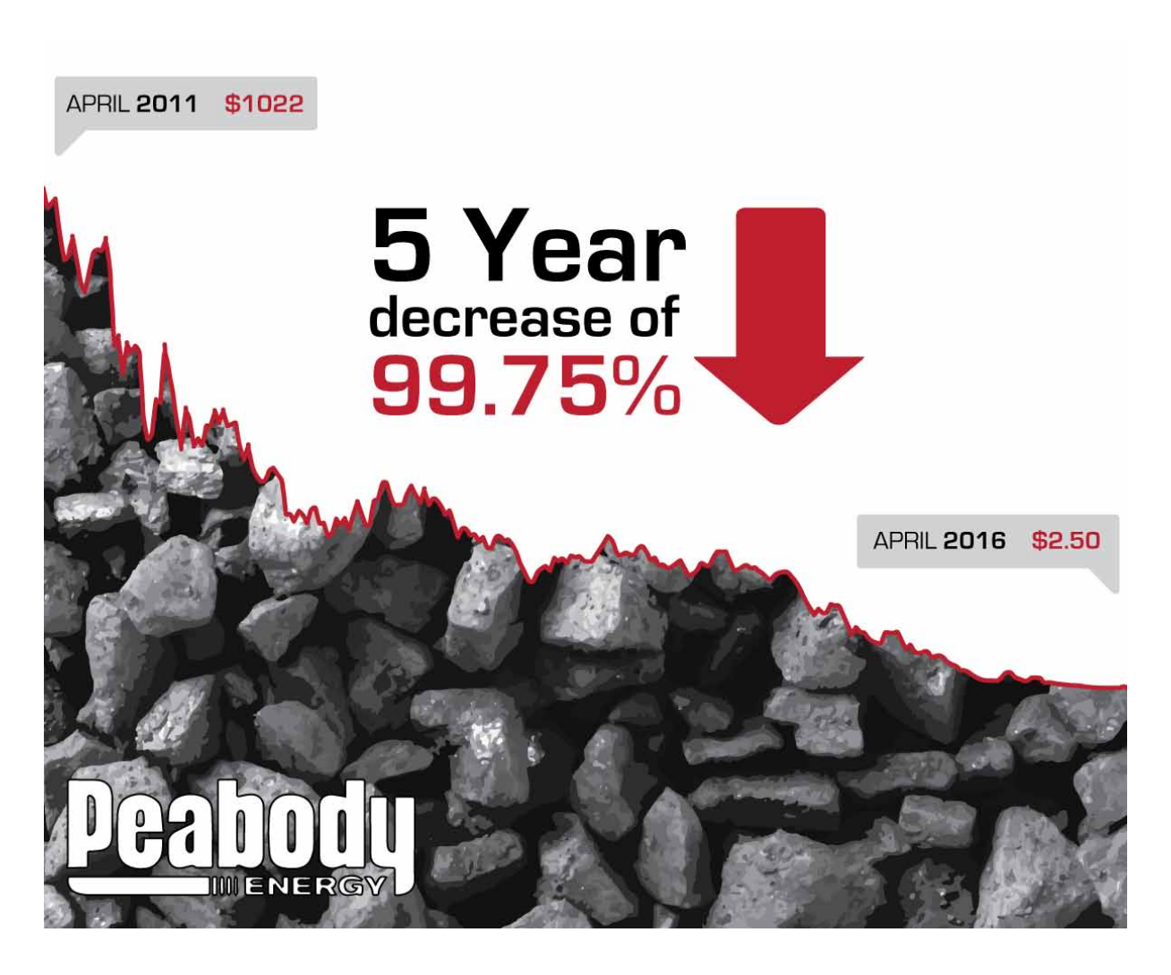
Peabody, the owner of Millennium Mine, faces bankruptcy but applied for a discount on its financial assurance due to the 'financial stability' of the company