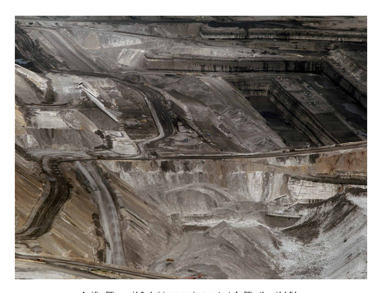
Avoiding filling a void: Coal mining companies can get out of refilling the voids left by mining - leaving a hole in the landscape

In 2015, the New South Wales state government conceded it would cost $2 billion to fill in just one single void at Rio Tinto's Mount Thorley coal mine. Since the amount was so high, a spokesman said, 'it would not be reasonable to impose a condition that requires Rio Tinto to completely or even partially backfill the final void'. The void was four times the size of Sydney's Centennial Park. Nevertheless, a Rio Tinto spokesperson reportedly said '[t]he final void will be largely hidden from view due to the surrounding landscape and extensive rehabilitation works planned after mining'. From this statement it is clear that Rio Tinto's understanding of 'rehabilitation' falls well short of restoring a site to its former state.