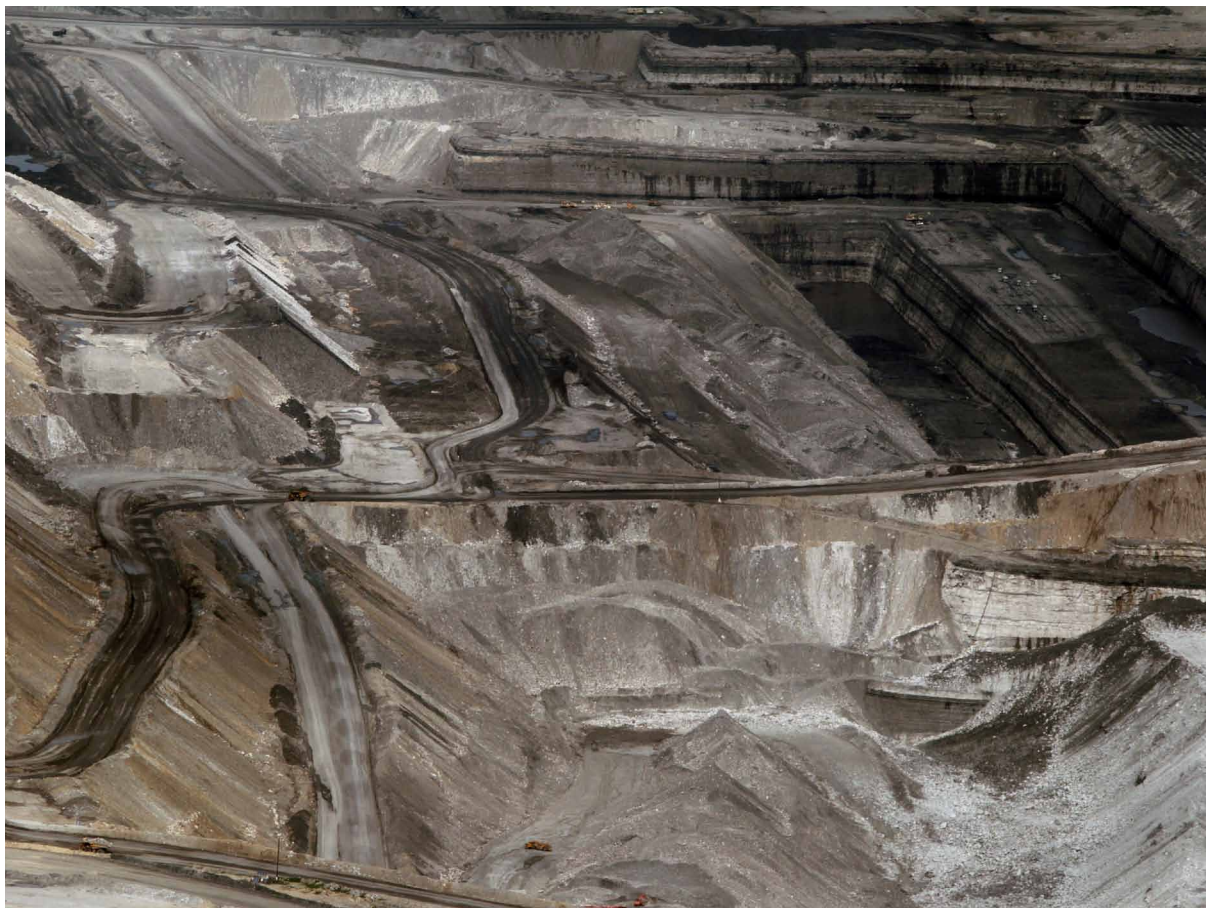
Avoiding filling a void: Coal mining companies can get out of refilling the voids left by mining - leaving a hole in the landscape

In 2015, the New South Wales state government conceded it would cost $2 billion to fill in just one single void at Rio Tinto's Mount Thorley coal mine. Since the amount was so high, a spokesman said, 'it would not be reasonable to impose a condition that requires Rio Tinto to completely or even partially backfill the final void'. 21 The void was four times the size of Sydney's Centennial Park. Nevertheless, a Rio Tinto spokesperson reportedly said '[t]he final void will be largely hidden from view due to the surrounding landscape and extensive rehabilitation works planned after mining'. 22 From this statement it is clear that Rio Tinto's understanding of 'rehabilitation' falls well short of restoring a site to its former state.